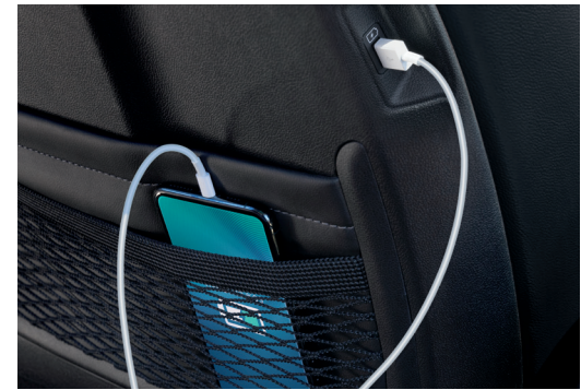
USB charging located throughout the cabin to charge everyone's devices.