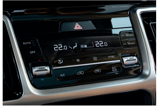
Dual-zone automatic climate control <sup>1</sup> lets you set your ideal cabin temperature.

We crafted Sorento's cabin to be thoroughly comfortable, and filled with an impressive range of standard and available premium features. Combined with the latest in technology, Sorento will indulge you with confidence.