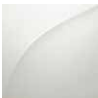
Snow White Pearl (P)